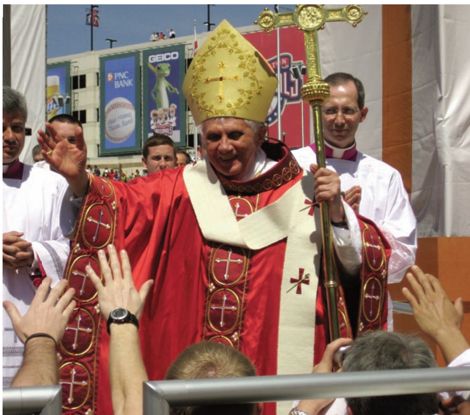
Pope Benedict XVI at Nationals Park in Washington, D.C., one of two places where he celebrated Mass for thousands, during recent trip to the United States.

From April 16 to 20, Pope Benedict XVI graced our country with his presence, receiving a warm and enthusiastic welcome from many who witnessed his visit and followed this historic event. His message of joy, hope and love did much to uplift the Catholic Church, our nation and the world. Of the many topics addressed during his visit, one of the most compelling had to do with the future of the Church and the need for vocations. The following remarks are excerpted from the pope's homily given at Yankee Stadium on Sunday, April 20.